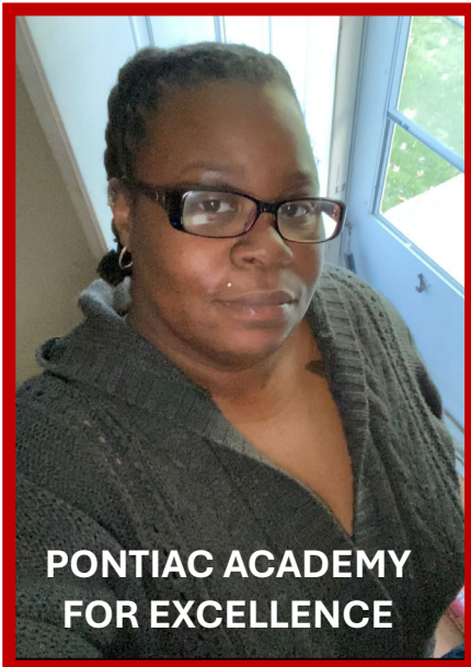
PONTIAC ACADEMY FOR EXCELLENCE